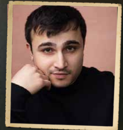
SERKAN AVLIK Görkem

TV credits include: Industry , Silo , Slow Horses and Da Vinci's Demons .